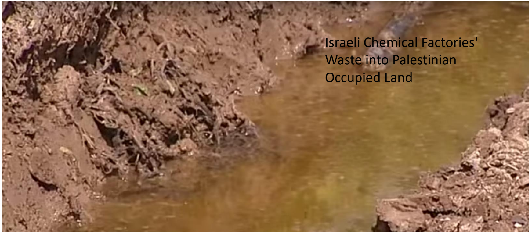
Israeli Chemical Factories' Waste into Palestinian Occupied Land