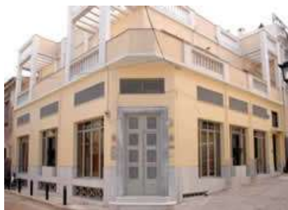
MIO-ECSDE Premises in Plaka, Athens

The Federation consists of Full and Corresponding Members who share the same benefits and rights, except for the right to vote at the Annual General Meeting (AGM), which is reserved only for Full Members. MIO-ECSDE is headed by an Executive Bureau, which in 2014 consisted of eighteen (18) Members. Eight members are from the EU Mediterranean countries, seven are from the non-EU Mediterranean countries, and three are ex officio members representing the two founders EEB and Elliniki Etairia and RAED. The Annual General Meeting (AGM) of the Member Organisations remains the main institution constituting the basis of the Federation. The AGM is convened once a year. The Federation's Secretariat is based in Athens, in the old and historic district of Plaka. The Secretariat was relocated in a newly restored building in the same (Plaka) area in January 2005.