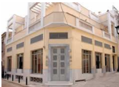
MIO-ECSDE Premises in Plaka, Athens

The Federation consists of Full and Corresponding Members who share the same benefits and rights, except for the right to vote at the Annual General Meeting (AGM), which is reserved only for Full Members. MIO-ECSDE is headed by an Executive Bureau, which in 2013 consisted of eighteen (18) Members. Eight members are from the EU Mediterranean countries, seven are from the non-EU Mediterranean countries, and three are ex officio members representing the two founders EEB and Elliniki Etairia and a co-opted member RAED. The Annual General Meeting (AGM) of the Member Organisations remains the main institution constituting the basis of the Federation. The AGM is convened once a year. The Federation's Secretariat is based in Athens, in the old and historic district of Plaka. The Secretariat was relocated in a newly restored building in the same (Plaka) area in January 2005.