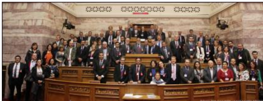
Group photo from the Hellenic Parliament

The Circle of Mediterranean Parliamentarians for Sustainable Development (COMPSUD) held its 10th Meeting, organised by its joint Secretariat, MIO-ECSDE and GWP/Med. Preparations began in May 2013 in order to hold