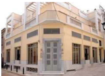
MIO-ECSDE Premises in Plaka, Athens

The Federation consists of Full and Corresponding Members who share the same benefits and rights, except for the right to vote at the Annual General Meeting (AGM), which is reserved only for Full Members. MIO-ECSDE is headed by an Executive Bureau, which in 2012 consisted of eighteen (18) Members. Eight members are from the EU Mediterranean countries, seven are from the non-EU Mediterranean countries, and three are ex officio members representing the two founders EEB and Elliniki Etairia and a co-opted member RAED. The Annual General Meeting (AGM) of the Member Organisations remains the main institution constituting the basis of the Federation. The AGM is convened once a year. The Federation's Secretariat is based in Athens, in the old and historic district of Plaka. The Secretariat was relocated in a newly restored building in the same (Plaka) area in January 2005.