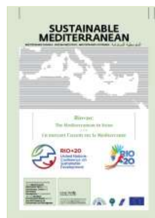
Front page of Sustainable Mediterranean N° 67

Each issue of Sustainable Mediterranean is distributed to around 2000 recipients including NGOs, international organisations, research centres, governmental bodies, libraries, etc. while a number of copies are available for our members and others on request, e.g. for conferences, etc. (free of charge) and of course they are also on-line on our web site.