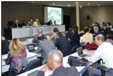
Snapshot from the side event organized by MIO-ECSDE at the Rio+20 Summit

MIO-ECSDE together with all major actors in the Mediterranean environmental scene, held the only Mediterranean official Side Event within the framework of the UN Conference on Sustainable Development (Rio+20) in Rio de Janeiro, Brazil. The event "Challenges and Opportunities for a Mediterranean Green Growth", took place on 19 June 2012 (15:30 - 17:00 Room T-3 RioCentro) and was co-organized with UNEP/MAP, the European Commission, the Union for the Mediterranean, Fondation Prince Albert II de Monaco, the Arab Network for Environment and Development, GWP-Med, etc.