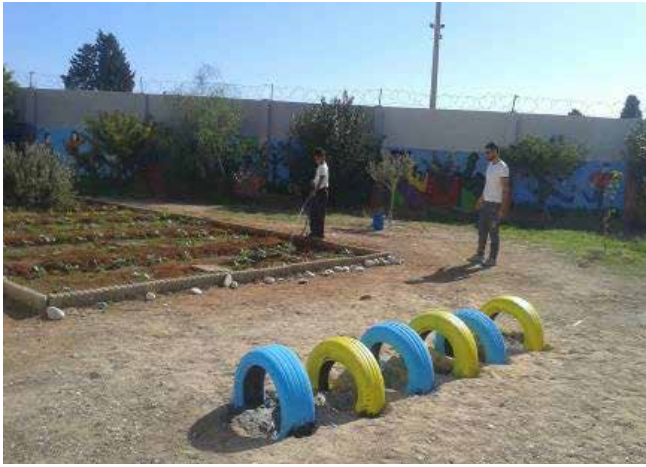
Fig 2 'Reforming' in the school yard

initiative was introduced this year (2017-18) which relates to a Plan that the school undertakes for its improvement in relation to sustainable development. This Plan sets a priority task that the school works on throughout the year.