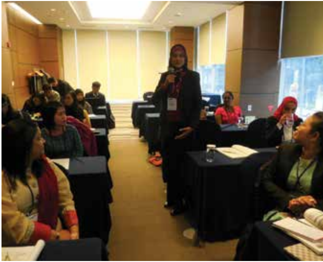
Fig 6 International workshops