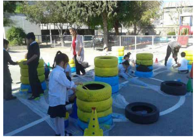
Fig 3 The school garden

ESD in Cyprus is acknowledged as a form of education that leads to change and contributes to Quality Education.