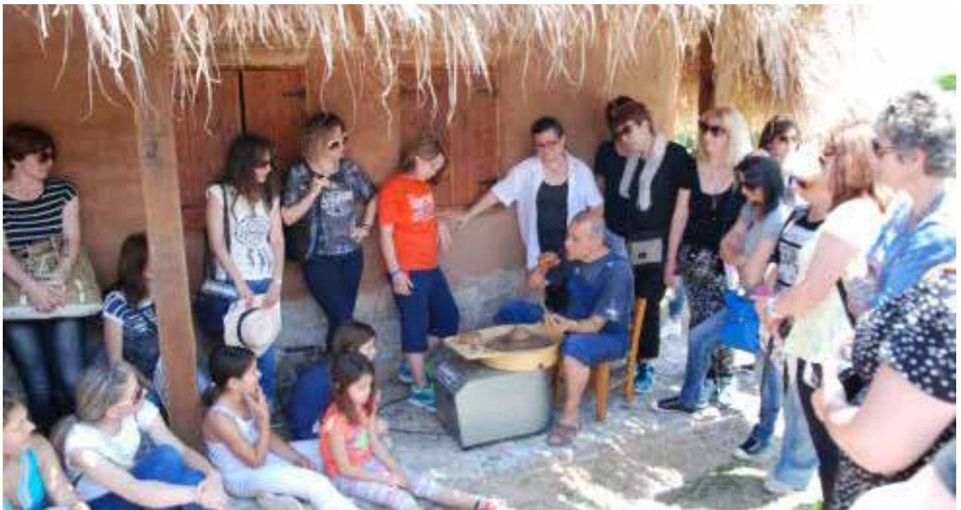
Fig. 12 Green Cultural Routes (2016) pottery activity snapshot at a local community

activities are not integrated in the daily school schedule. An appropriate framework must be legislated. In non-formal education, the activities carried out are not part of a specific coordinated action. It is important to make clear that the implementation of the SDGs and consequently the SDG4/ EDUCATION 2030 is country-led and country-driven. As it is a long-term agenda, it is important to develop cooperation and synergies with all stakeholders.