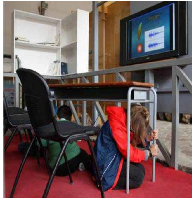
Fig.13 Educational activity in the Lesvos Geopark on earthquakes

Challenges can be converted to opportunities. In formal education, the commitment of teachers and students is remarkable in carrying out ESD projects, on a voluntary basis. Particularly for secondary education, the extracurricular