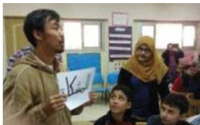
Fig 5 JICA volunteer with school students