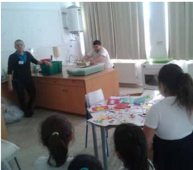
Fig 1 Paper recycling lab.

In this brief paper some representative examples of actions and initiatives undertaken in the context of the National Plan on ESD are presented which indicate the importance and the special emphasis that ESD is given within the Cyprus education system.