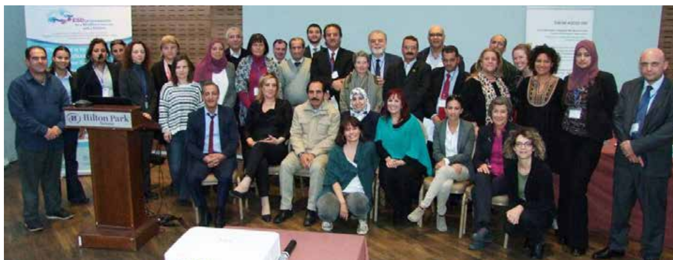
Fig. 15 Family photo of the 1 st Meeting of the Mediterranean ESD Committee

In addition to the above, the participants suggested the consolidation of synergies between the countries with the Mediterranean Commission on Sustainable Development (MCSD), the UN Environment/MAP-Barcelona Convention system, the UfM labelled Blue Med initiative. The