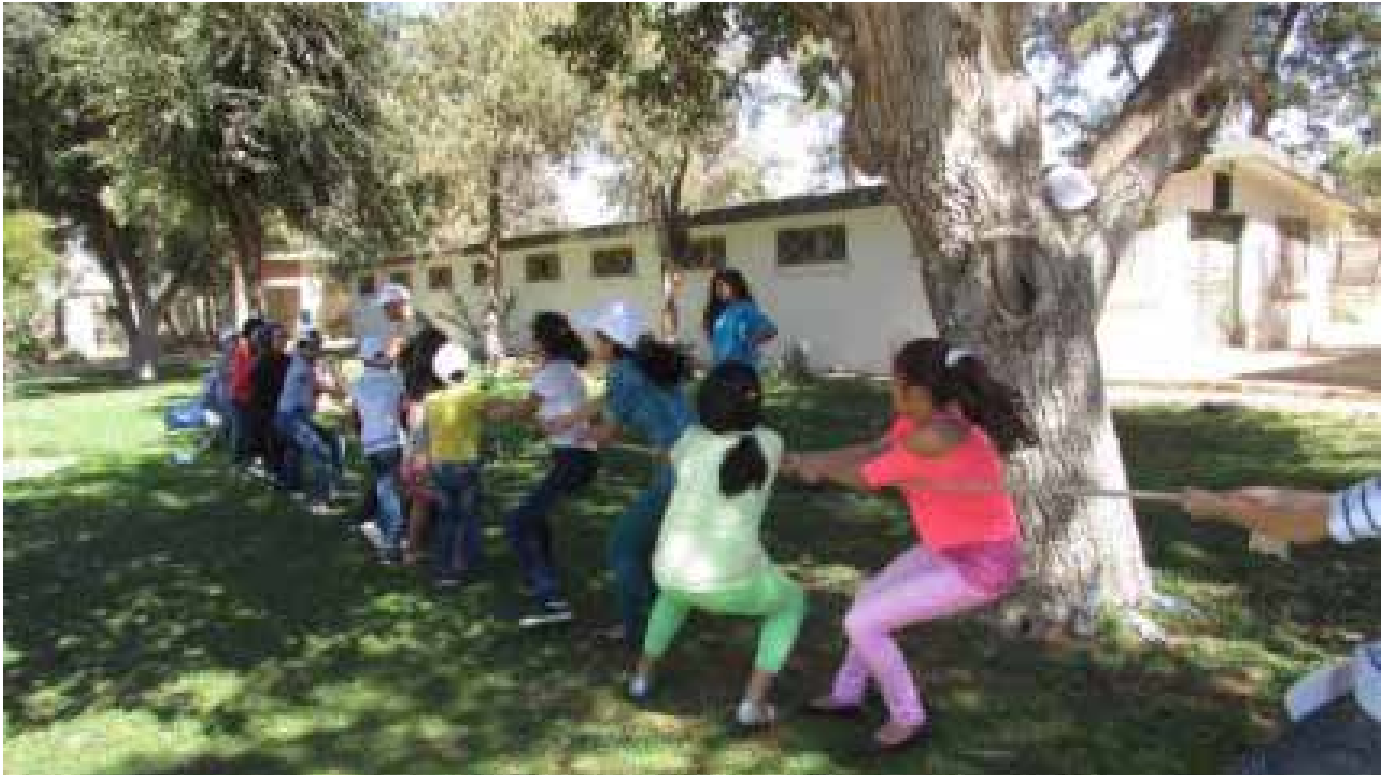
Fig. 11 Public events on sustainable consumption and environmental protection targeting families

The Center for Educational Research and Development (CERD) acted as an associate national body. The specific objective of the action is to empower the Lebanese pupils and youth to shape values and attitudes, to develop skills and capacities towards sustainable development and environmental protection, and to put these into practice to promote change at the local, national and regional levels. The main activities of the Project were: