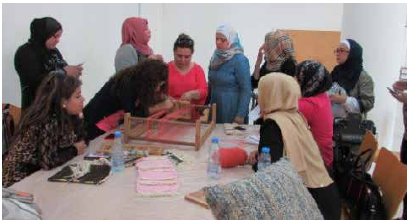
Fig 10 Loom weaving workshop for women

The project was an initiative to promote a culture of sustainability among the Lebanese children and youth, their families and the local communities. It was funded by the EU within the AFKAR III Programme that is managed by the Office of the Minister of State for Administrative Reform and was implemented in partnership with the Italian NGO "Armadilla", the Federation of Mediterranean NGOs "MIO-ECSDE" and the Lebanese NGO "ALMEE".