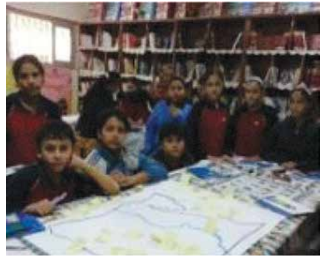
Fig 9 Trips & lectures