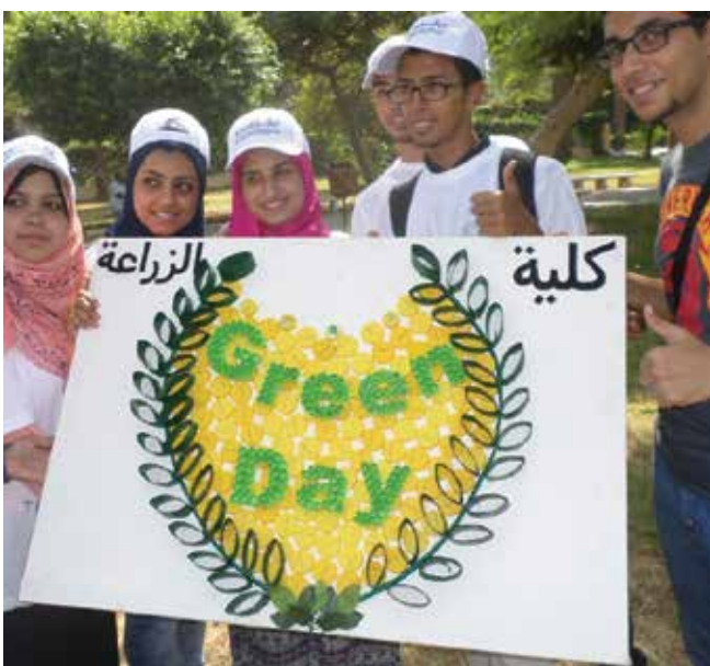
Fig 8 Green Days in schools & universities