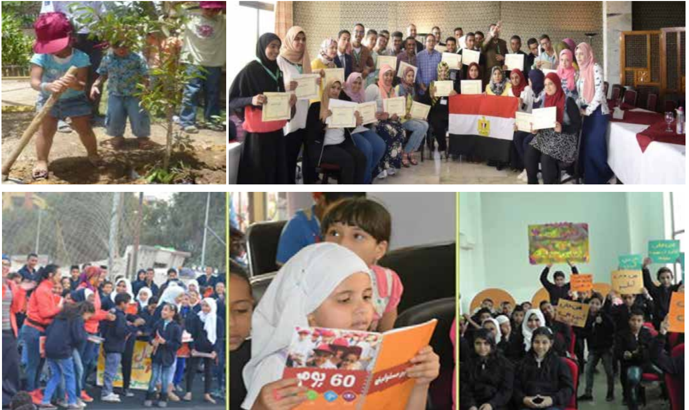
Fig.14 AOYE and ESDF awareness raising activities with youth