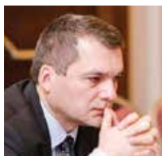
Mr. Zaal Lomtadze

United Nations Economic Commission for Europe – UNECE, zaal.lomtadze@unece.org