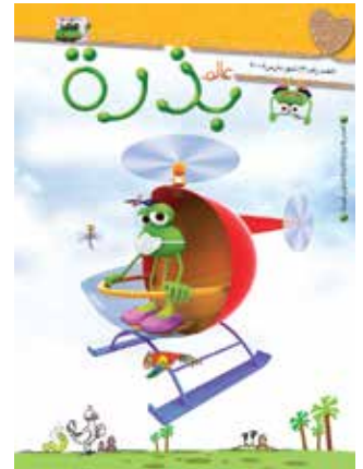
Fig 7 BEZRA Cartoon Character