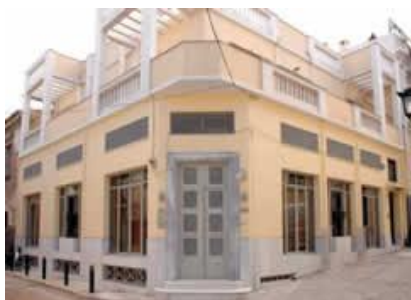
MIO-ECSDE Premises in Plaka, Athens

The Federation consists of Full and Corresponding Members who share the same benefits and rights, except for the right to vote at the Annual General Meeting (AGM), which is reserved only for Full Members. MIO-ECSDE is headed by an Executive Bureau, which in 2017 consisted of eighteen (18) Members. Eight members are from the EU Mediterranean countries, seven are from the non-EU Mediterranean countries, and three are ex officio members representing the two founders EEB and Elliniki Etairia and RAED. The Annual General Meeting (AGM) of the Member Organisations remains the main institution constituting the basis of the Federation. The AGM is convened once a year. The Federation's Secretariat is based in Athens, in the old and historic district of Plaka.