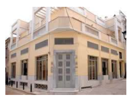
MIO-ECSDE Premises in Plaka, Athens

The Federation consists of Full and Corresponding Members who share the same benefits and rights, except for the right to vote at the Annual General Meeting (AGM), which is reserved only for Full Members. MIO-ECSDE is headed by an Executive Bureau, which in 2012 consisted of eighteen (18) Members. Eight members are from the EU Mediterranean countries, seven are from the non-EU Mediterranean countries, and three are ex officio members representing the two founders EEB and Elliniki Etairia and a co-opted member RAED. The Annual